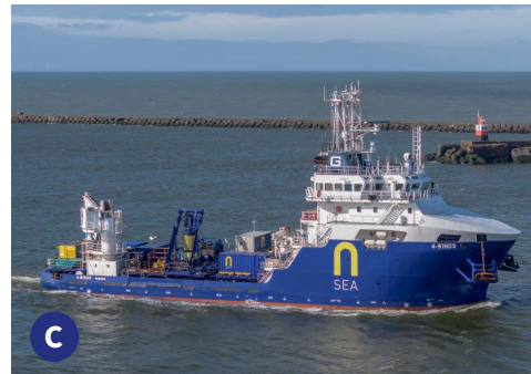
A Project location overview B Nearshore Survey Vessel - AMS Panther C Offshore Vessel 4-Winds D Saab Panther ROV E MacArtney Focus 2 ROUV